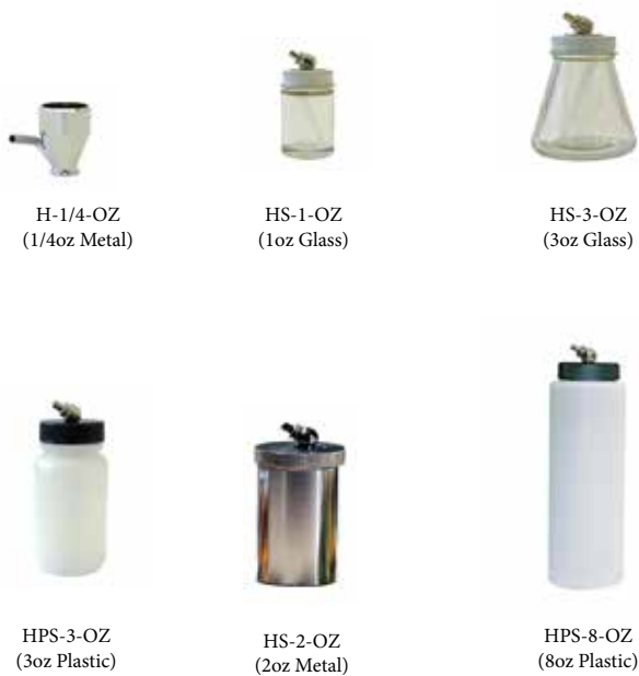
Old Style Replacement Parts